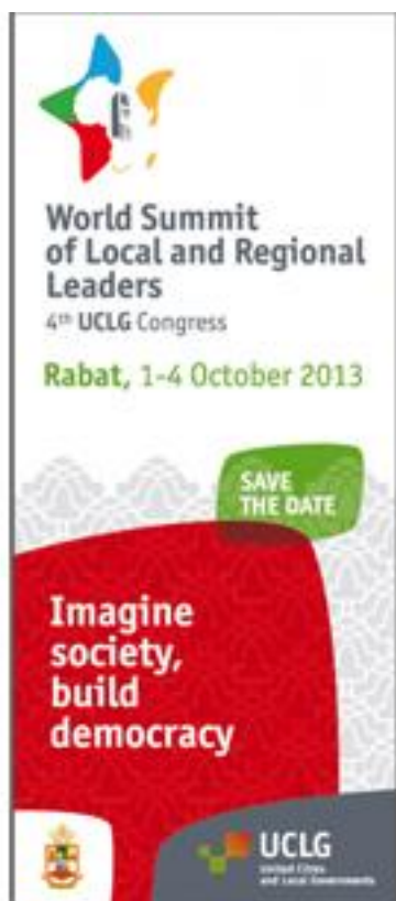
Save the date